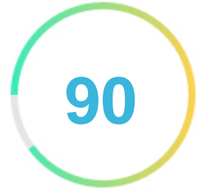
Your Website Score