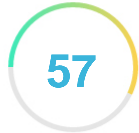
Your Website Score