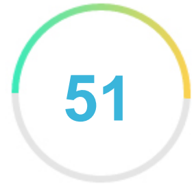
Your Website Score