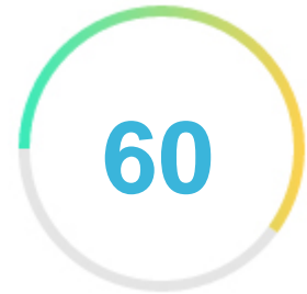
Your Website Score