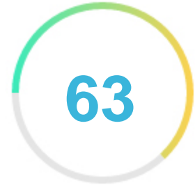
Your Website Score